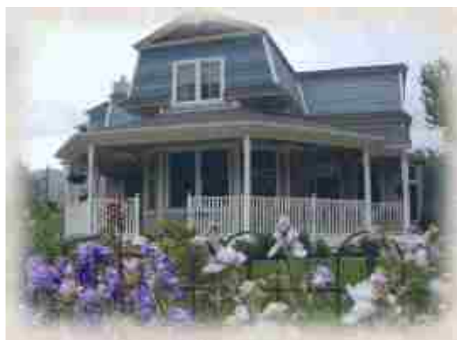
The Iron Gate Inn

http://www.swansamplerguild.org/ShakespeareArticle.pdf